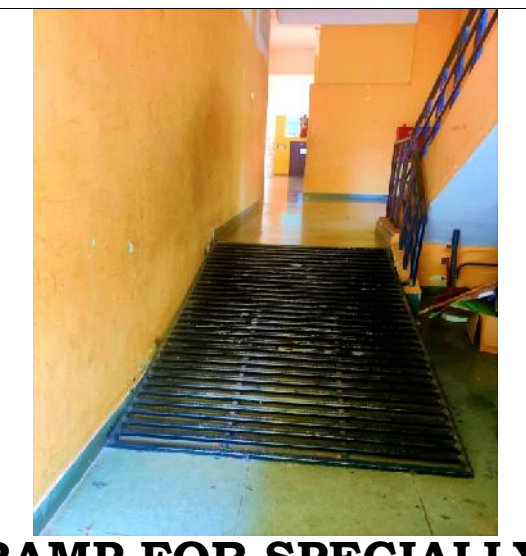
RAMP FOR SPECIALLY ABLED