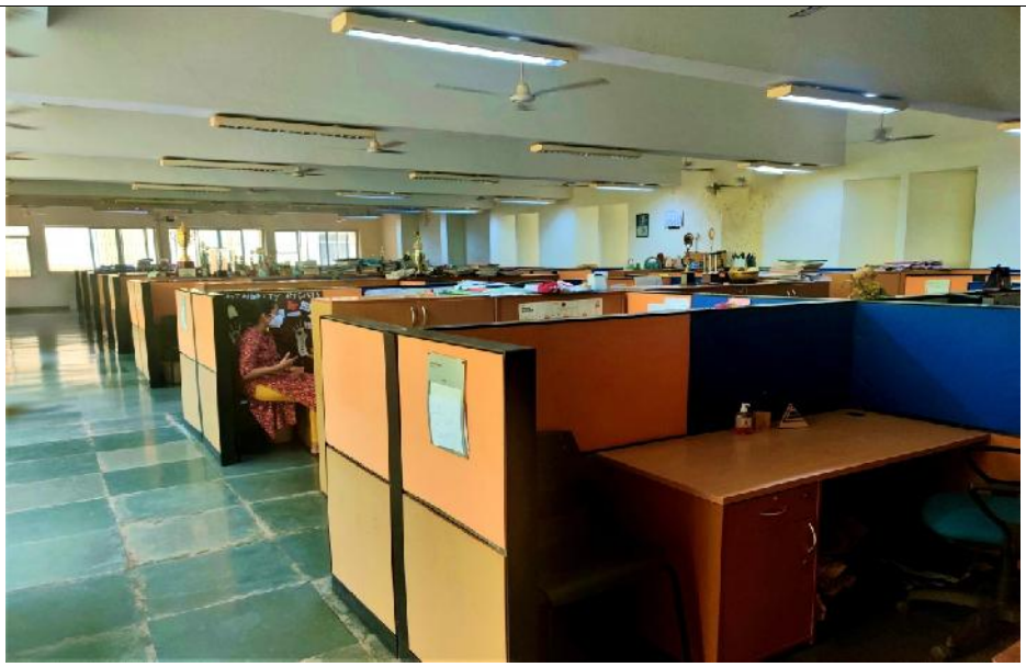
FACULTY CUBICLES – STAFF ROOM