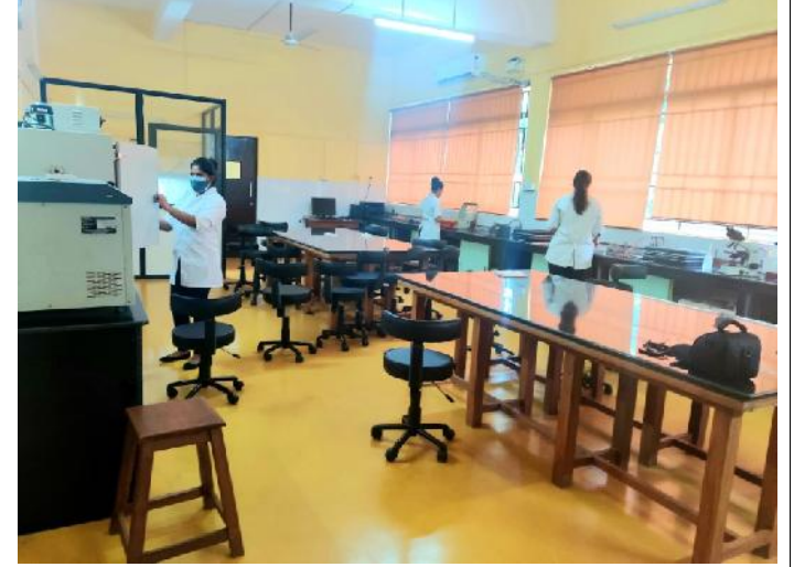
CENTRAL RESERACH LAB